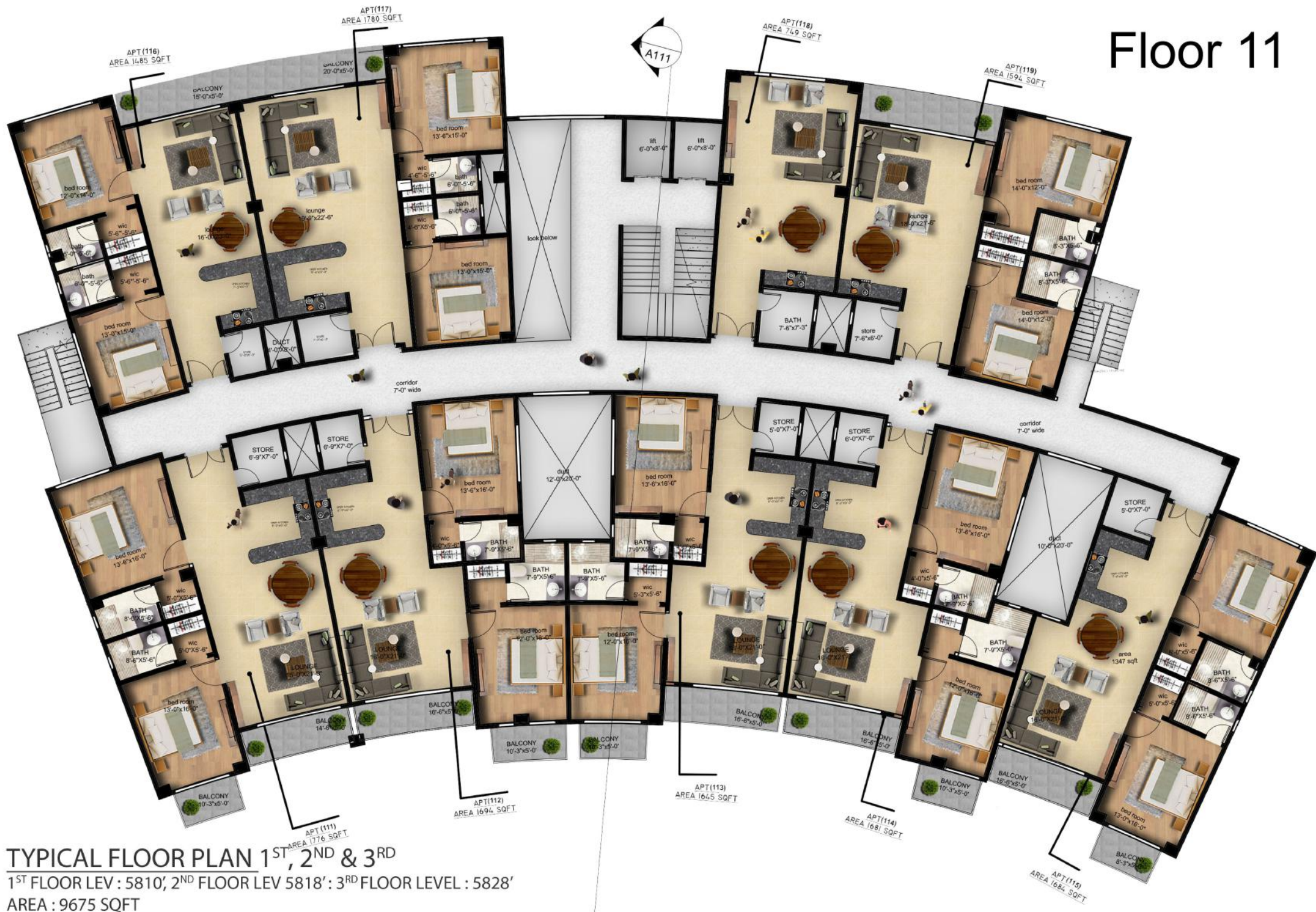
TYPICAL FLOOR PLAN 1 ST , 2 ND & 3 RD 1 ST FLOOR LEV : 5810', 2 ND FLOOR LEV 5818' : 3 RD FLOOR LEVEL : 5828' AREA : 9675 SQFT