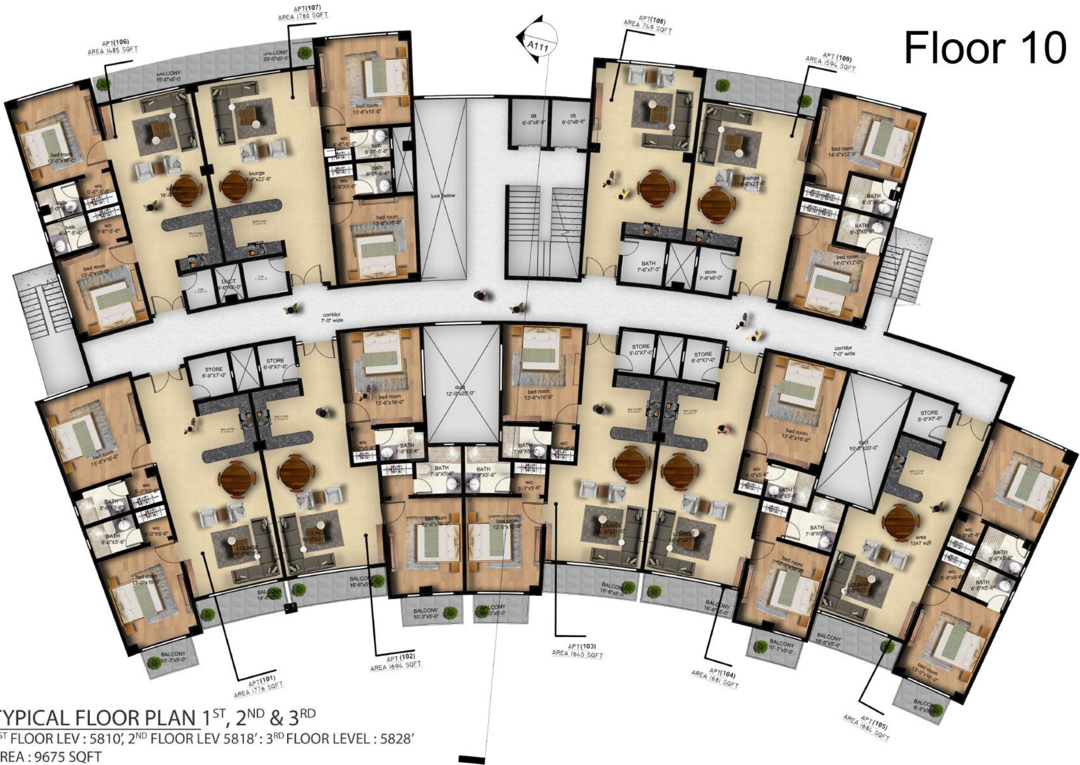
TYPICAL FLOOR PLAN 1 ST , 2 ND & 3 RD 1 ST FLOOR LEV : 5810'; 2 ND FLOOR LEV 5818'; 3 RD FLOOR LEVEL : 5828' AREA : 9675 SQFT