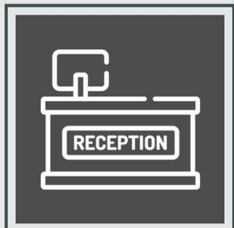
Concierge & Reception