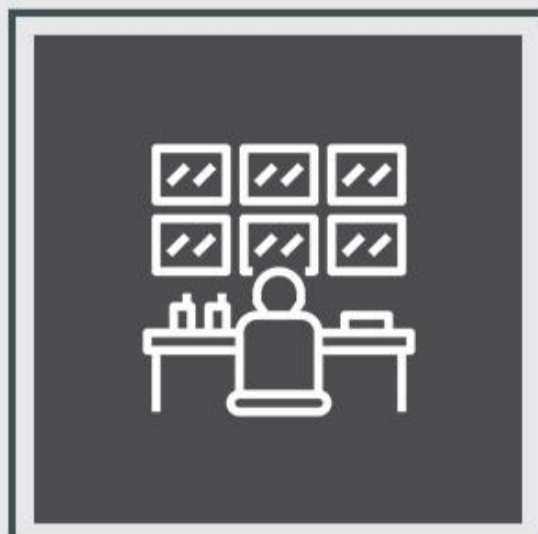
24/7 Security & Surveillance