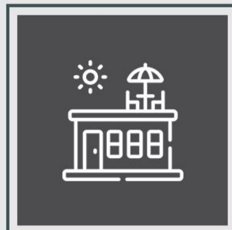
Rooftop Sitting Area